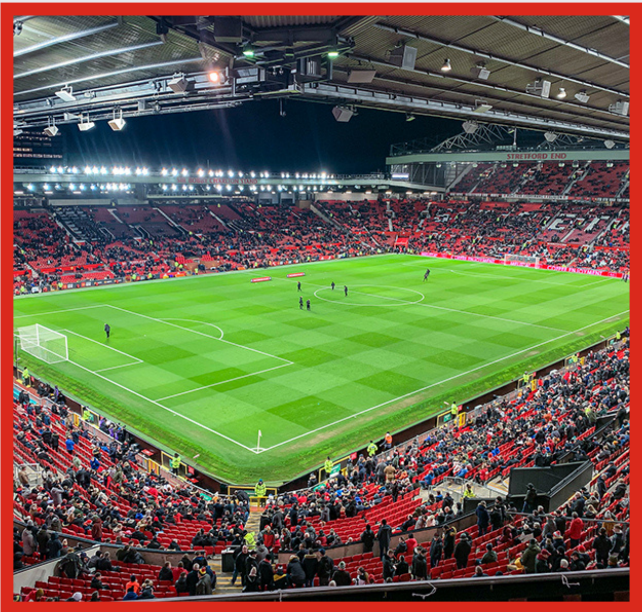
View from seat